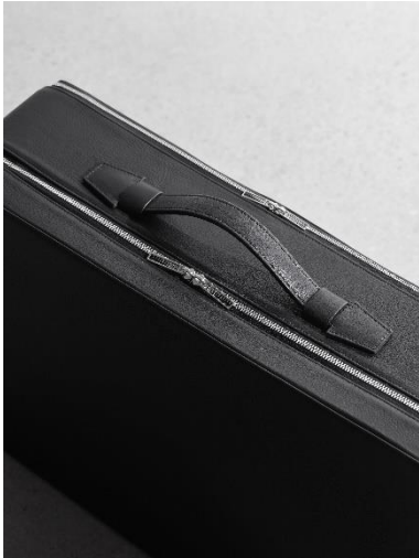
Travel suitcase SUIT-CASE, Design in Cooperation with Sir David Chipperfield, calfskin leather, 2020