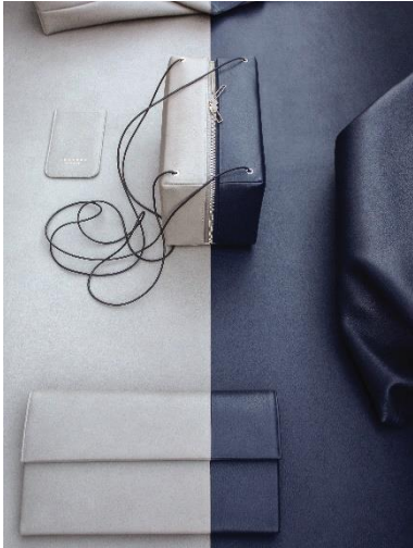
Installation WHERE I END AND YOU BEGIN, Berliner Mode Salon 2016 with phone case FOIX, 2016, shoulder bag LINDEN, 2014, clutch HAZE, 2014, calfskin leather © Dimitrios Tsatsas, TSATSAS