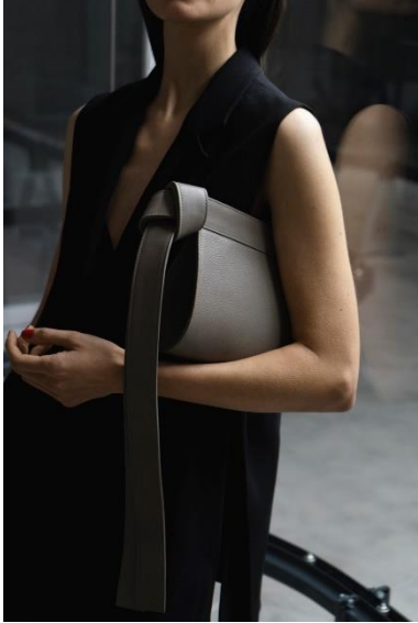
Clutch TAPE XS, calfskin leather, 2017 © Dimitrios Tsatsas, TSATSAS