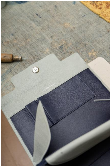
Insight into the manufacture of the 931, 2018