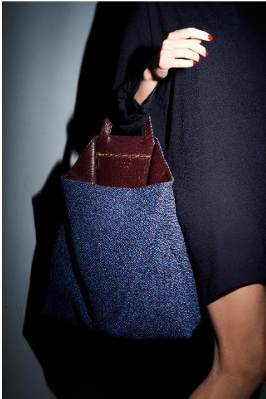
Tote bag FLUKE, SO_FAR EDITION 01, Textiles by Raf Simons for Kvadrat, 2017