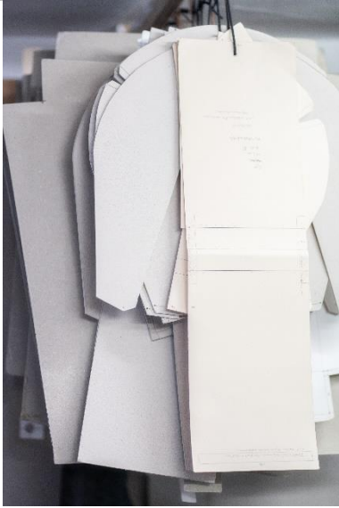
Patterns and work samples, 2019 © Dimitrios Tsatsas, TSATSAS