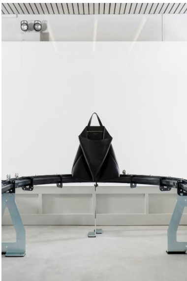
Tote bag FLUKE, calfskin leather, 2012 © Dimitrios Tsatsas, TSATSAS