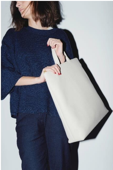
Tote bag LUCID, calfskin leather, 2012 © Gerhardt Kellermann