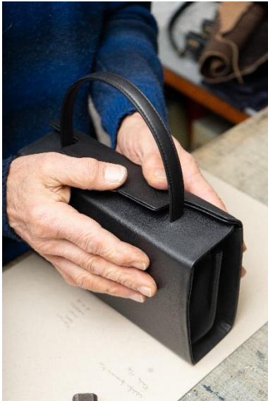
Insight into the manufacture of the 931, 2018