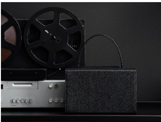
Top handle bag 931, design in cooperation with Dieter Rams, calfskin leather, 2018