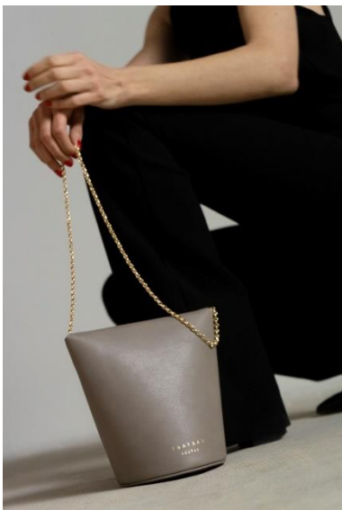
Shoulder bag OLIVE, calfskin leather, 2019 © Dimitrios Tsatsas, TSATSAS