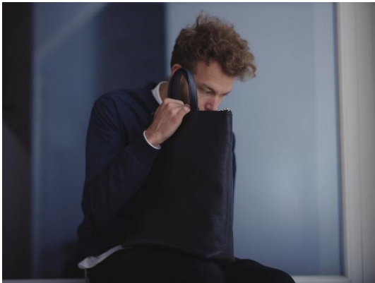
Tote bag LUCID, calfskin leather, 2012 © Gerhardt Kellermann