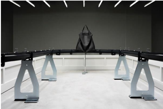
Tote bag FLUKE, calfskin leather, 2012 © Dimitrios Tsatsas, TSATSAS