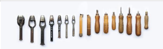
Leather craft tools, 2015