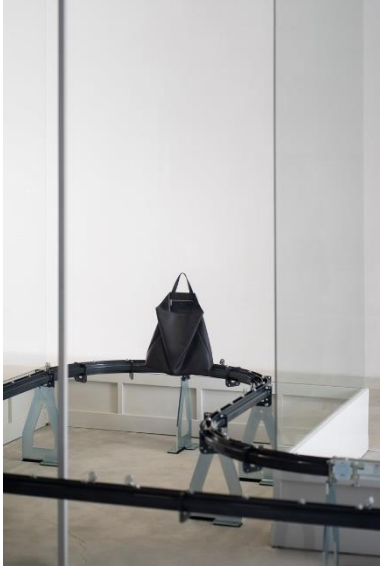
Tote bag FLUKE, calfskin leather, 2012 © Dimitrios Tsatsas, TSATSAS